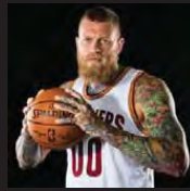
Chris "Birdman" Andersen